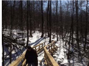
Fork Run Bridge

For More Information Click Here: Fork Run Awareness & Clean up Day