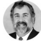
David Shapiro CITY OF CALABASAS Councilmember