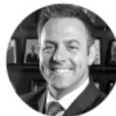
Joe Buscaino L.A. CITY Councilmember