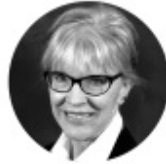
Emily Gabel Luddy CITY OF BURBANK Mayor