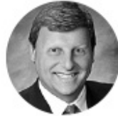
Ara Najarian CITY OF GLENDALE Councilmember