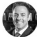
Joe Buscaino L.A. CITY Councilmember