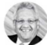
Fred Gaines CITY OF CALABASAS Mayor pro Tem