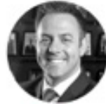
Joe Buscaino L.A. CITY Councilwoman