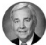
William Koehler CITY OF AGOURA HILLS Mayor Pro-Tem