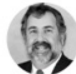
David Shapiro CITY OF CALABASAS Councilmember