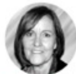
Mary Sue Maurer CITY OF CALABASAS Mayor