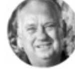
Keith Mashburn CITY OF SIMI VALLEY Councilmember