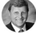
Ara Najarian CITY OF GLENDALE Councilmember