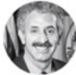
Mike Feuer L.A. CITY Attorney