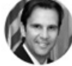
Cameron Smyth CITY OF SANTA CLARITA Mayor