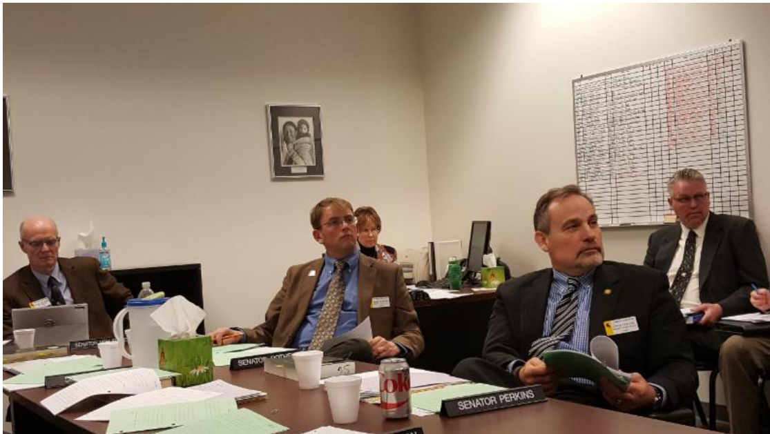
Senate Minerals Committee discussed Ski Safety Bill last Monday.

The Wyoming Business Council's funding continues to be compromised. While most state agencies have seen reductions in the 10 percent range over the past year, the Business Council has been cut by 37 percent. Additional cuts are now being floated via amendments, including moving $80,000 to cover Tribal Liaison; $150,000 for the State Fair; $193,705 to the DEQ; $2.7 million to the State Engineers Office for water development; $400,000 to the Department of Health; and $200,000 in staffing reductions. Another $3.7 million in cuts is an unfortunate commentary. The Business Council was created to help grow Wyoming's economy. The Business Alliance was instrumental in its creation. Continued reductions and unraveling, no doubt will compromise its present good work.