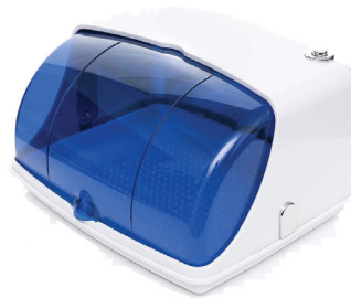
Mini UV Sterilizer Box and Disinfection Cabinet