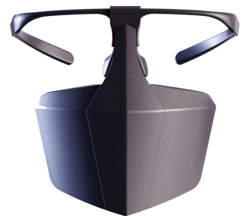
Reusable Rigid Face Shield / Anti-Saliva Spit Guard, Dark Blue