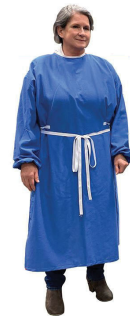
Reusable Medical Isolation Gown, Level 1, Blue Cotton, 70 Washes