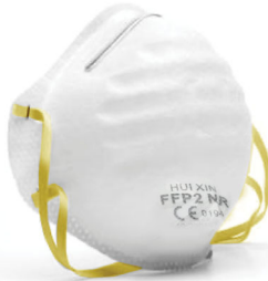
Face Masks, FFP2 Rated KN95