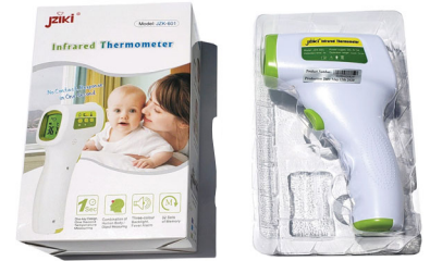
Non-Contact Thermometer, Hand Held Instant-Read