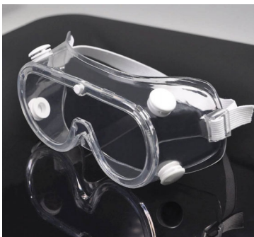
Eye Protective Isolation Goggles, FDA Approved