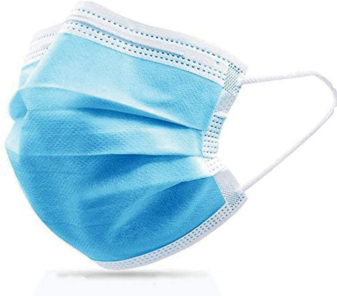
3-Ply Disposable Blue Mask

CP Lab Safety is a leading supplier for PPE for workplaces around the globe.