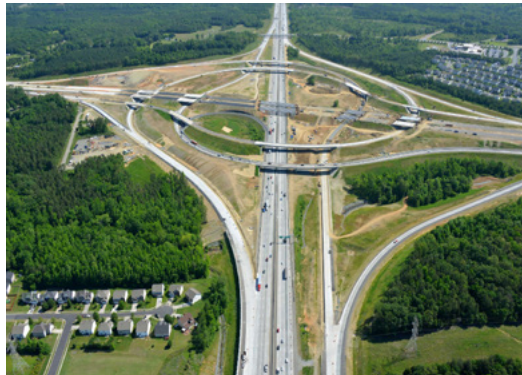
STV Incorporated's "I-485 / I-85 "Turbine" Interchange in Charlotte.

On Thursday, November 5th, ACEC/NC Members and their guests gathered together for the Annual Engineering Excellence Awards. This year's Gala was held at Bay 7 at the American Tobacco Campus in Durham, NC which is run by the Angus Barn. The upstairs lounge area was filled with boards from North Carolina firms that won awards this year.