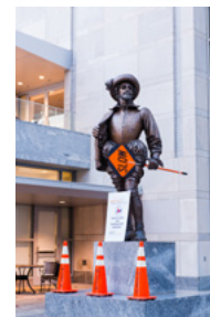
Sir Walter Raleigh Decorated at the Raleigh Convention Center

On Wednesday, October 21st, over 972 attendees & 32 exhibitors gathered for the 2015 ACEC/NC & NCDOT Joint Transportation Conference. The day started out hearing from the Senior Leadership of NCDOT and then moved into 6 concurrent educational break-out sessions.