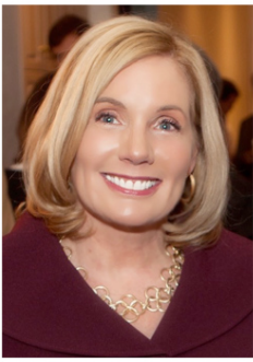
Rep. Holly Grange (R-New Hanover)

Small R&D Business Tax Relief – The House budget also includes a new sales tax refund for R&D companies. The provision allows companies that (1) primarily engaged in R&D, (2) with less than 200 employees, (3) $5 million in annual receipts, and (4) spending more than the greater of $10,000 or 3% of annual receipts to, claim a refund of up to $20,000 in sales tax paid on R&D supplies. In economically distressed counties, companies would be eligible to claim up to $20,000 in either sales tax paid on R&D supplies, or 50% of the state share (4.75%) of sales tax paid on all of the company’s purchases. Refunds would be subject to a statewide cap of $15M. If total claims from all businesses exceed the cap, refunds to all businesses would be prorated equally to bring total refunds within the cap. The goal of the refund package is to not only reward start-up companies engaged in substantial R&D, but to encourage R&D in rural areas as well. Thanks to Representative Jason Saine (Senior Chairman, House Finance Committee), Representative Bill Brawley (Senior Chairman, House Finance Committee) for their work on this proposal.